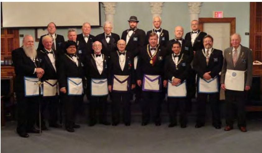
Medford Lodge 2017 Officers

www.MedfordLodge178.com hb2539@verizon.net