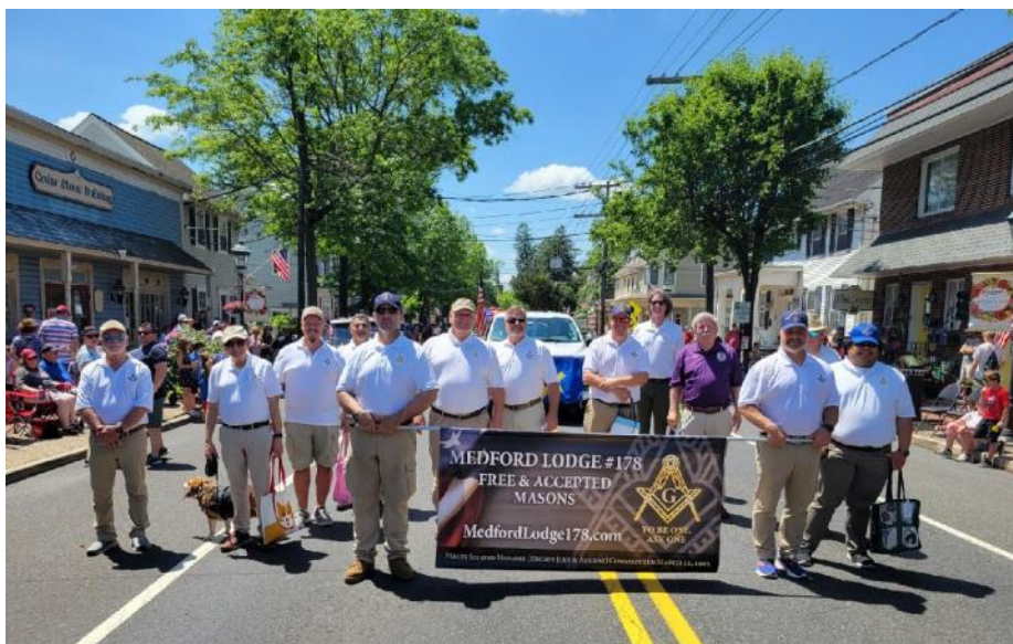
Memorial Day Parade in Medford