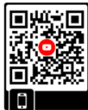
Rigil Kent Abellanosa

Before I forget, some musical selections for your consideration: